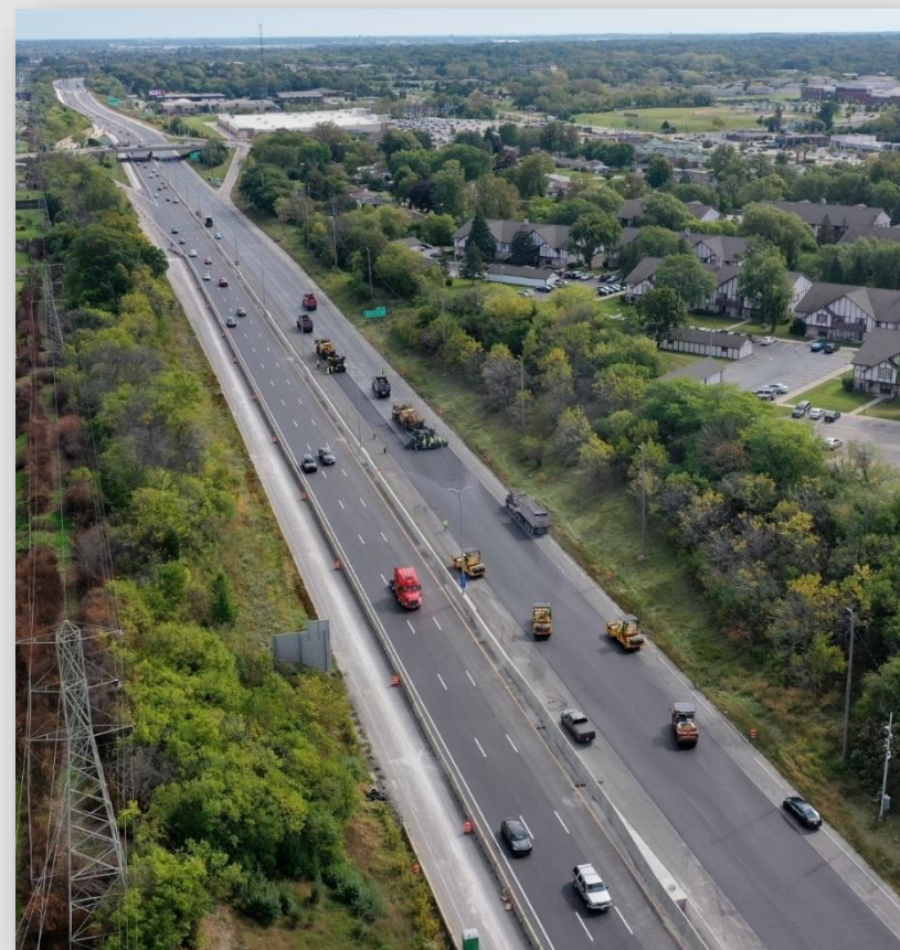
I-894 paving, Milwaukee County