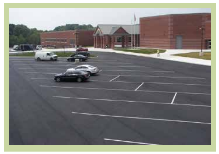
Figure 1.2. 45° Stalls

With limited paving real estate, 45° stalls (Figure 1.2) are sometimes preferred. The small change in angle also permits the use of narrower aisles. This angle further reduces the parking stall count.