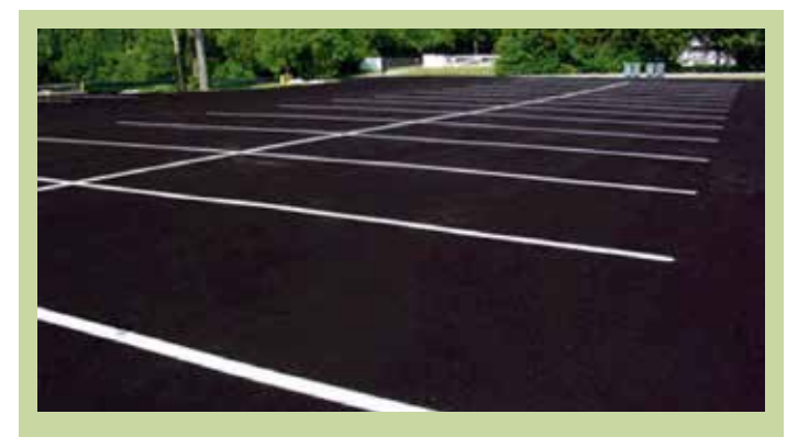
Figure 1.1. 90° Stalls

The 90° angle (Figure 1.1) achieves the highest parking stall capacity. This type of parking is more suited for all-day parking (such as employee parking) because it has the highest degree of difficulty for entering and leaving parking stalls. It is generally not preferred for "in and out" lots such as fast food restaurants and banks.