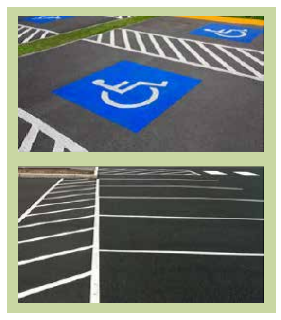
Figure 1.4. ADA Pavement Markings

The Americans with Disabilities Act (ADA) provides federal requirements for slopes, markings (Figure 1.4), clearances, and other features for accessible parking stalls. Such stalls should be designed and constructed per federal code and local requirements to ensure compliance.