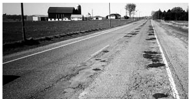
Across a road network, pavements will vary on the PASER scale. Shown here: a 10 (top), a 5 (middle) and a 2 (bottom). WAPA's new Technical Bulletin will help you implement a program to address repairs for the network of pavements as a whole.

Despite the slick talk and big promises, it's a good idea to do your homework first and see how all options fit into your pavement management program. Some of these pavement treatments may well be a good fit for your needs, but if you don't have a sound basis for selecting which