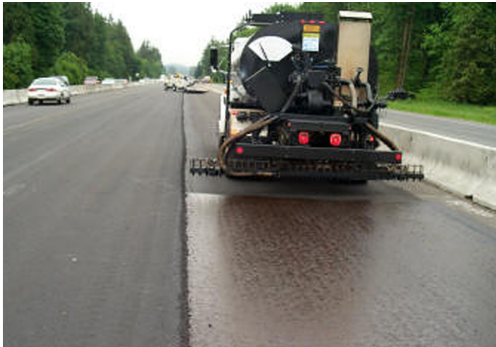
A thin, even layer of tack coat ensures strong bonding between asphalt lifts.

Rather than skipping the tack coat, a much better solution is to look at ways to ensure its successful application. We have laid out some considerations—best practices and alternative approaches—that will result in tack coats that get the job done right.