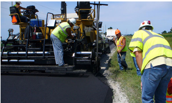
The Safety Edge is one of the Every Day Counts technologies finding its way into WisDOT projects this summer.

mix asphalt has been used in various projects throughout Wisconsin in the past. (See the article at right.) As part of the Every Day Counts program in 2011, Wisconsin DOT plans to include warm mix on at least one project in each of the five WisDOT regions this season. The state is working closely with contractors to identify the most appropriate projects for warm mix. ■