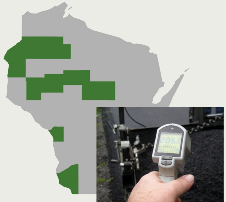
Warm mix is constructed at temperatures 50 to 100 degrees F cooler than hot mix. A number of counties across Wisconsin are already using it, with more to come this summer.

Some of the large-quantity users of WMA in Wisconsin are Chippewa, Grant, Polk and Washburn counties. WMA has also been used to a lesser scale in Burnett, Dunn, La Crosse, Marathon, Sawyer and Taylor counties.