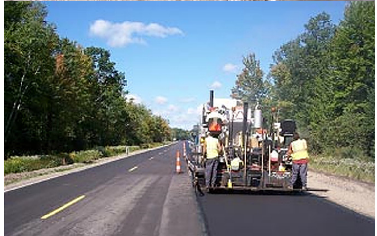
Rubblization allows lanes of traffic to remain open during pavement reconstruction.