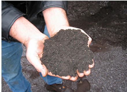
Recycled asphalt shingle grindings

For making this new kind of green project possible and for turning it into a reality, we applaud the forward-minded efforts of WisDOT and Mathy. ■