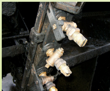
Dry ice blasting quickly restores a tack coat spray bar and nozzles to like-new condition.